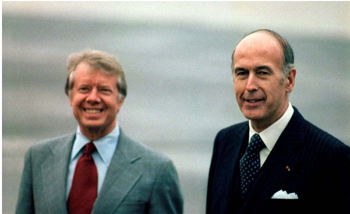
U.S. president Jimmy Carter (left) and French president Giscard d'Estaing (right) are believed to have considered the shah's illness an important reason why he should be ousted.