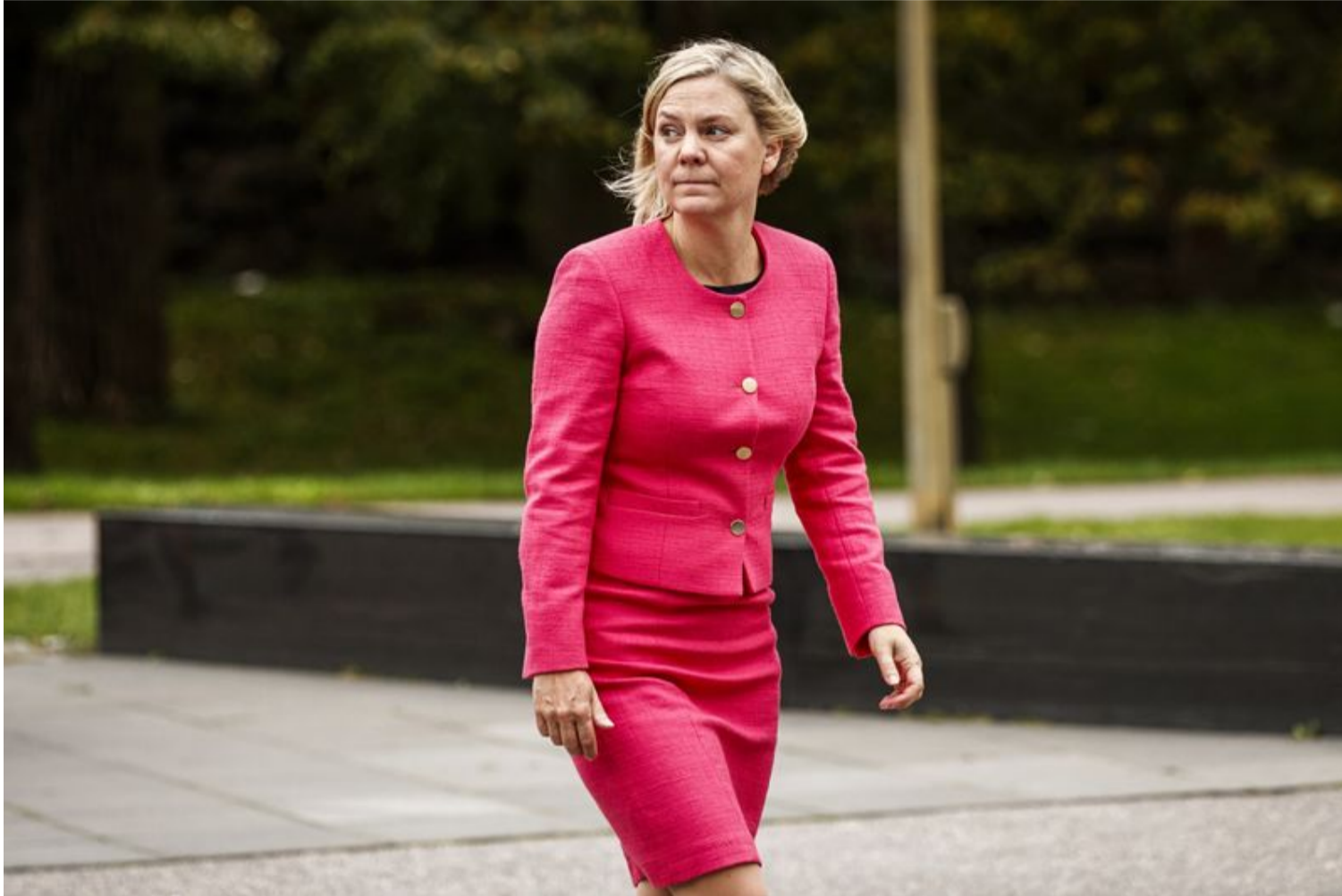
Swedish Prime Minister Magdalena Andersson