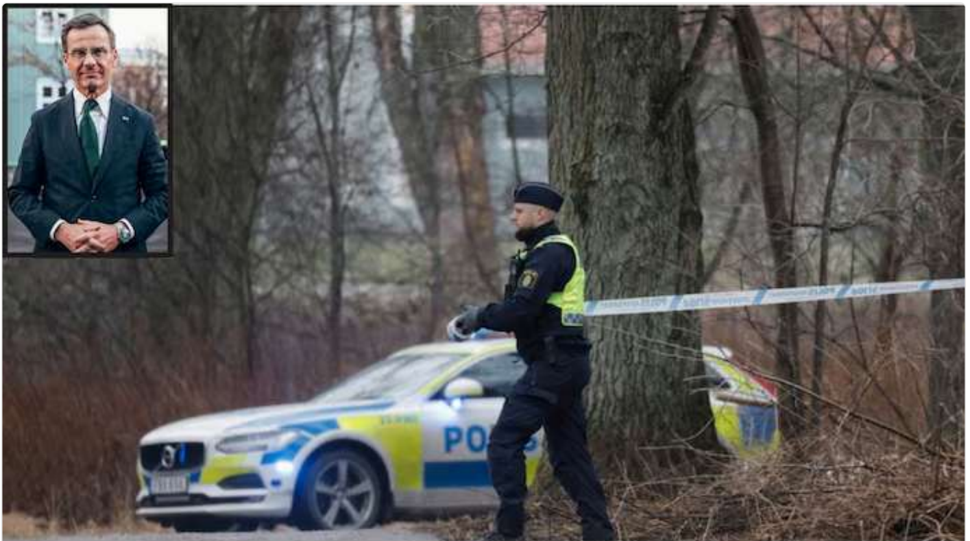
Five people were shot in the latest incident of violent crime in Sweden in Orebro. Prime Minister Ulf Kristersson (inset) has admitted that Sweden's gang war problem is not under control.